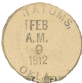
Figure 3. Feb. 9, 1912 Four-bar Tatum, OKLA postmark

A Postal Card postmarked Feb. 9, 1912 with a four-bar Tatum, OKLA. cancel is shown in Figure 2. A cropped image of the postmark is shown in Figure 3.